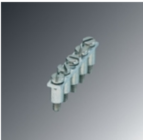
Fixed bridge, number of positions: 5, color: silver

Please be informed that the data shown in this PDF Document is generated from our Online Catalog. Please find the complete data in the user's documentation. Our General Terms of Use for Downloads are valid ( http://phoenixcontact.com/download )